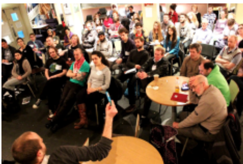
Rich Man's World

This two day conference saw over 100 people, including students, long time activists, and first-time campaigners come together in Glasgow. The weekend featured a day-long 'economics is for all of us' workshop and a women's radical walking tour of Glasgow. Campaigners also came together to conduct protests and stunts around Glasgow on a range of issues.