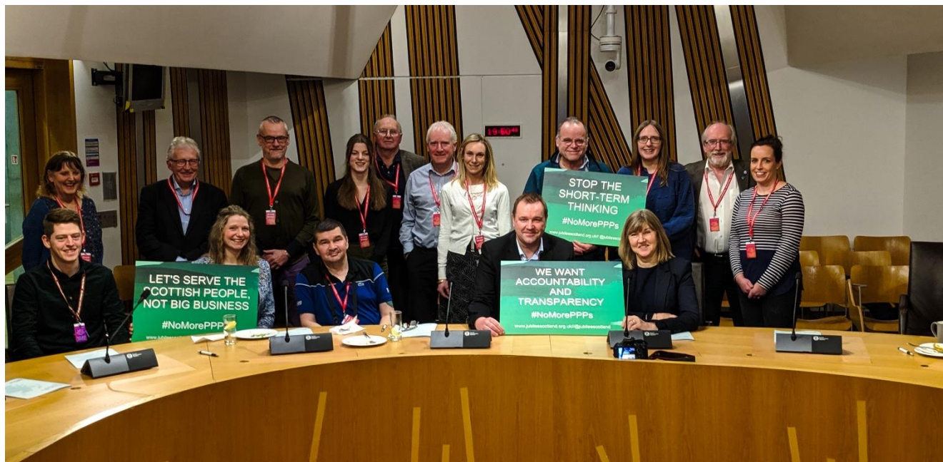
Launch of our PPP report at the Scottish Parliament, January 2019

In January 2022 we returned to campaigning against the use of Public Private Partnerships (PPPs) in Scotland. We completed Stage 1 of the 'Scotland against PPPs' campaign in 2019. Back then we worked with stakeholders and politicians to expose the extent of the PPP problem in Scotland and published the report "Rethinking Private Financing of Scottish Public Projects". See our short movie from 2019 here and read the report here .